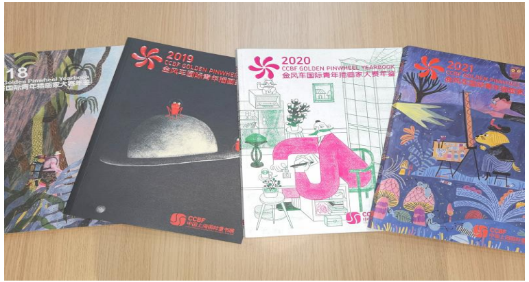
CCBF Golden Pinwheel Young Illustrators Competition Yearbooks