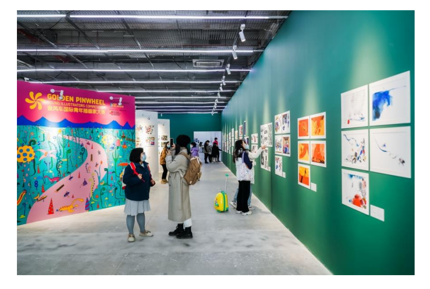
2021 Golden Pinwheel Illustration Exhibition

Faithful to its core objective, the Golden Pinwheel Competition has shaped its prizes and distinctions on providing unique and distinctive opportunities to its participants. As an example, thewinner of the Golden Pinwheel Grand Award (China) in Book Publishing Category will be invited to attend the 2024 edition of the Bologna International Children's Book Fair (BCBF), and the winner of the Golden Pinwheel Grand Award (International) inBook Publishing Category will receive an invitation to the 2024China Shanghai International Children's Book Fair (CCBF). Both invitations include a flight ticket and full accommodation, covered by the event organiser. The winner of the Golden Pinwheel Grand Award (China &International) in Commercial Category will receive bonus reward of CNY 10,000 (tax included) provided by competition committee. The invited artists will have the opportunity to participate as guests in various illustration-related activities taking place at the fair.