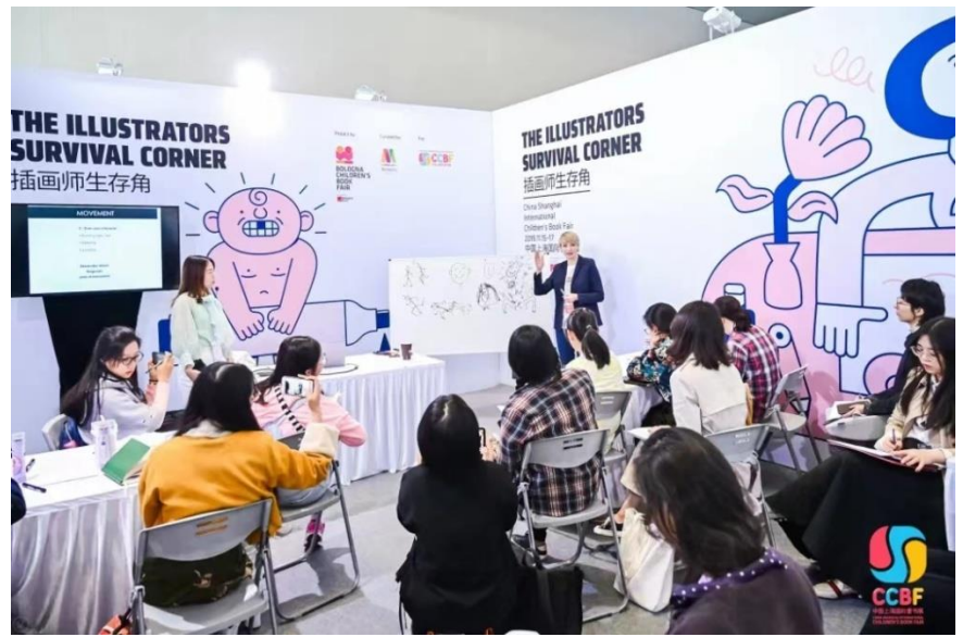
British Illustrator Elina Ellis at 2019 CCBF