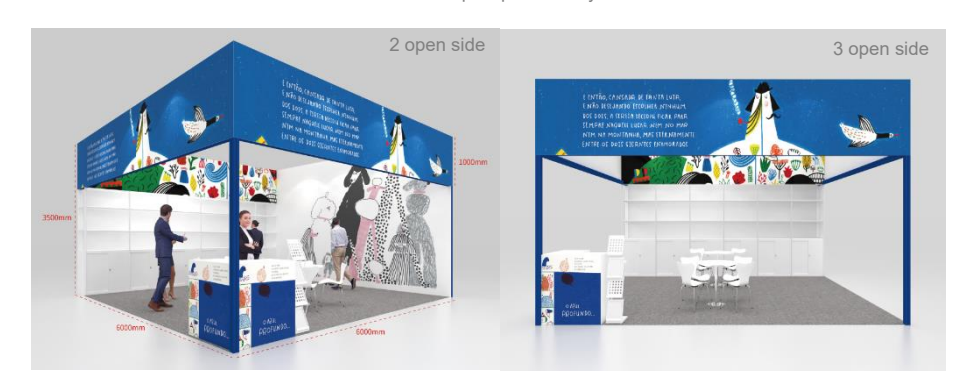
Graphic provided by exhibitors

Note: please refer to EXHIBITOR MANUAL to order additional furnitures.