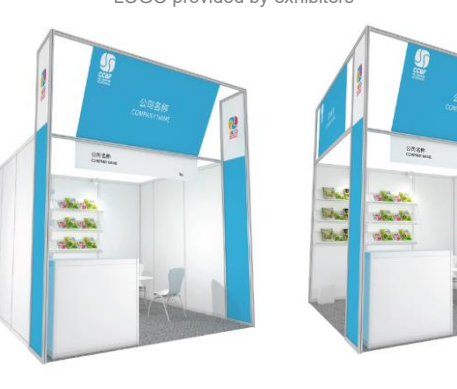
LOGO provided by exhibitors