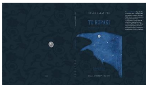
WINNER: The Raven

BolognaBookPlus for general publishing, within the wider context of the internationally recognised home of book illustration, BCBF. The competition is curated for BolognaBookPlus by the specialist Milan based partnership, Mimaster .